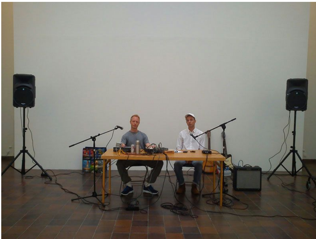
The Embassy live at Göteborgs Konsthall, 2013