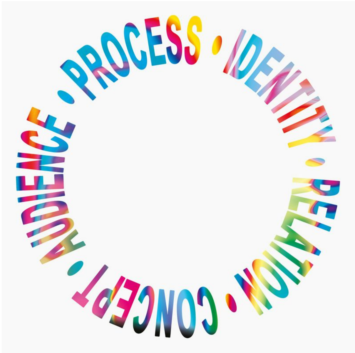
Cover art for Sweet Sensation in collaboration with The Embassy and Dan Lissvik, 2013

https://www.youtube.com/watch?v=jCn6U7yeDdU